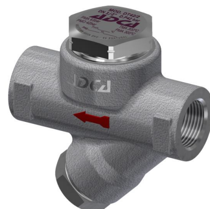
( Threaded nickel plated )